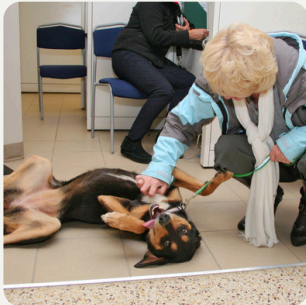
Municipal Animal Shelter