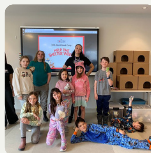
Humane education and dog training