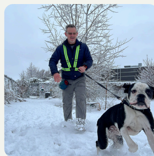
Foster and Volunteering