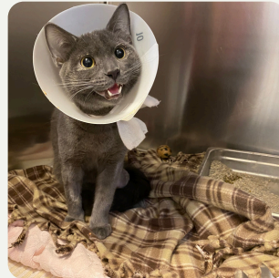
Sheltering and daily care