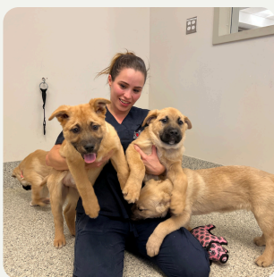
Behaviour support and enrichment