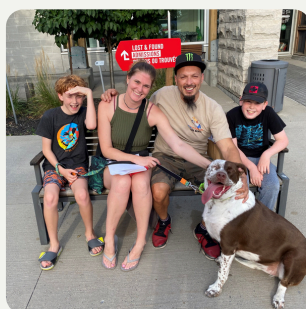
Finding perfect matches