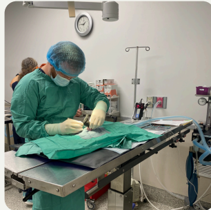
Veterinary care in the OHS Clinic