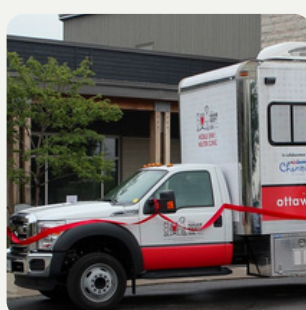
Accessible community services