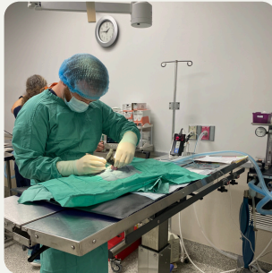
Veterinary care in the OHS Clinic