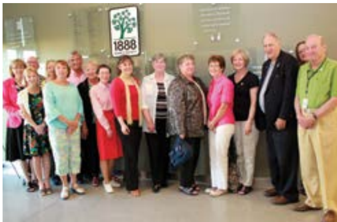
Members of the OHS 1888 Legacy Society