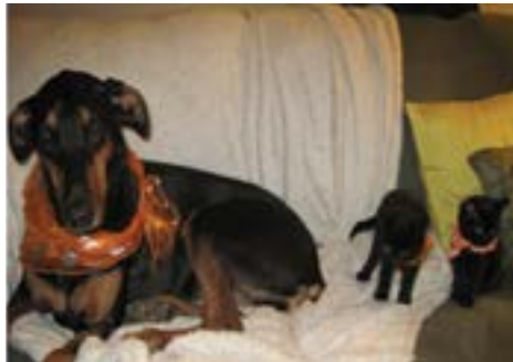
Sweetie Pie, Nutmeg and Pepper

Through the foster program, I've seen firsthand the comprehensive care that the OHS provides, with enthusiasm and compassion. Ottawa is fortunate to have strong community support for our animal shelter – financially, and with volunteers and local media. Many shelters simply cannot invest the veterinary care, the medications, the surgeries and the behavioural training that makes many animals adoptable.