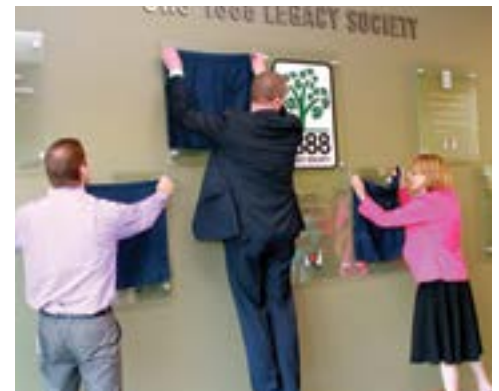
OHS staff and OHS president of the board of directors prepare to unveil the OHS 1888 Legacy Society Donor Wall.