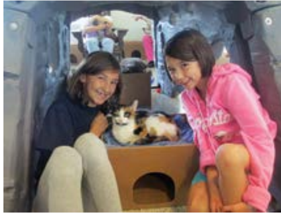
Changing the future for animals with humane education

Visiting classes will be provided with an informative presentation in the OHS's Education Centre followed by a hands-on experience with temperament-tested companion animals. Students will then