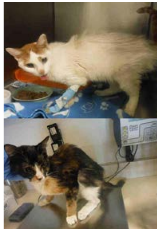
Mango and Tango were just days from death when an OHS veterinarian first laid eyes on them.

Investigation Services agents are struggling to end cruelty to animals so Mango, Tango and other animals like them don't have to suffer. The need for support is greater than ever, as the number of investigations has grown by 26 per cent in just two years. The province has recognized this growing need and is now funding part of the work of RIS investigators. Unfortunately, the funding only covers a small portion of the ever-increasing need. While every dollar of that funding will go toward saving animal lives, we still need your help.