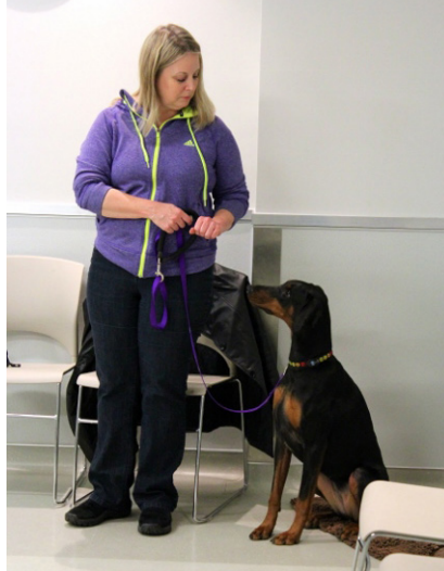
OHS obedience classes help build the bond between dogs and owners.

relationship. In every class we see families actively creating better relationships with their canine companions, resulting in a community of well-trained dogs and well-trained owners, helping to create a brighter future for Ottawa's animals. 🐾