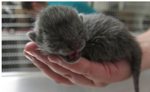
This kitten was born of a mother rescued from an animal hoarder.

Once rescued, not all the animals survive, she said. Some are in such bad shape they