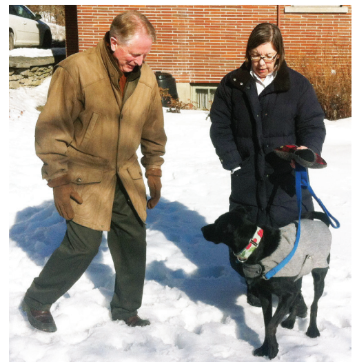
After six months of recovery, Breezy has found a forever home with her new family.