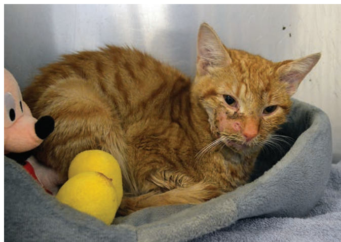
Gulliver on arrival.