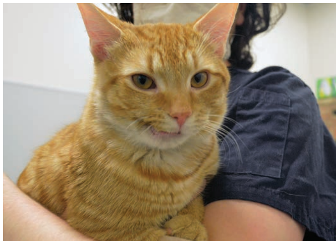
Gulliver on the mend.

From all of us and all the animals, thank you for everything you do.