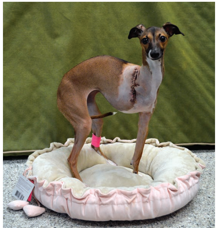
Kira, the Italian greyhound, recently had her leg amputated.