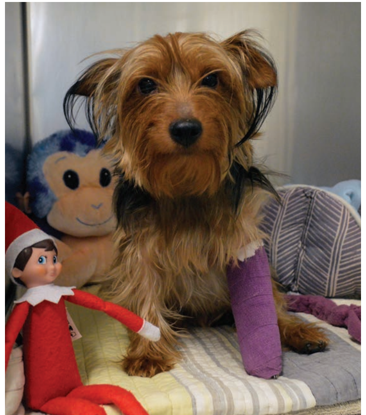
Lucky in a cast.