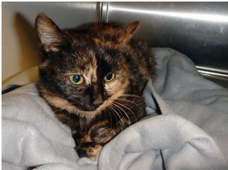
"Bella" 4-month old tortie cat with leg amputated.

While we ended 2018 with multiple broken legs, we're keeping our paws crossed that we see fewer of them in 2019! 🐾