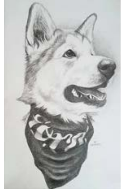
Olivia's (14) gorgeous drawing of Lemon the dog.