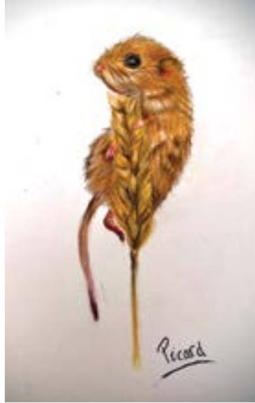
Amelia's (13) beautiful coloured pencil drawing of a field mouse on wheat.