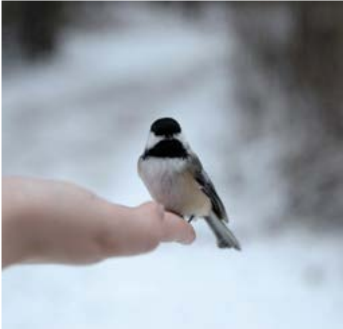
Gwenith's (14) spectacular photo of a chickadee.

Here are some of our favourites from recent competitions: