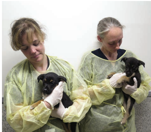
OHS Clinic Staff with Northern puppies.

When resources permit, the OHS accepts the transfer of animals into its care in order to help other communities. The OHS has rigorous protocols in place to safeguard the health of the transferred animals. In preparation