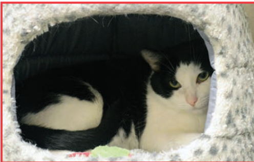
Molly (A211267) may be shy at first, but she'll be as affectionate as they come once she gets used to you. She is looking for a quiet home where she can be your best friend.