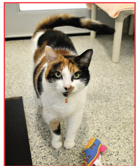
Callie (A215705) loves to run around and have fun with lasers. She's looking for a family to give her attention when she's playful.