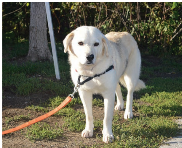
Dakota getting comfortable with a leash.

for the arrival of the Northern animals, OHS staff prepared isolation rooms to quarantine the incoming animals from the general population. Fortunately, all of the dogs and cats that arrived were healthy—and friendly! The dogs in particular were well socialized from living among people on the reserve. After their arrival, OHS staff immediately began providing the medical attention the animals needed to prepare them for adoption. One mother dog was placed in foster care with her two puppies. Over the following three weeks, OHS clinic staff provided the dogs with flea treatments and deworming, vaccines, microchipping, sterilization, and for some of the dogs, dental procedures. Because the dogs are not accustomed to being inside (or on a leash!), OHS staff and volunteers have been working tirelessly with them to help them make a confident transition into a loving adoptive home.