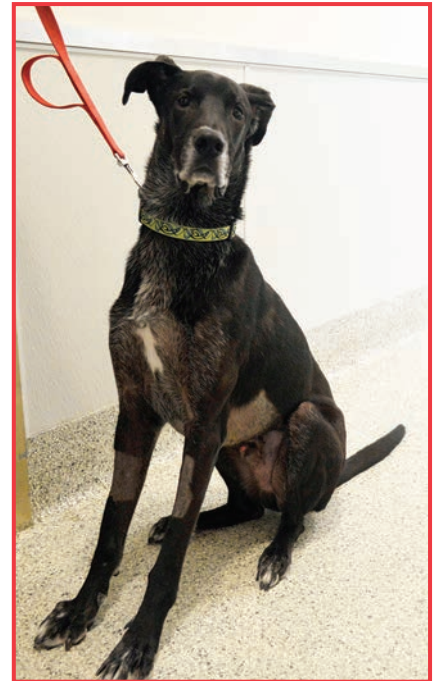
Max (A202547) is affectionate and loves to make new friends. He is looking for a forever home where he will get a lot of attention.